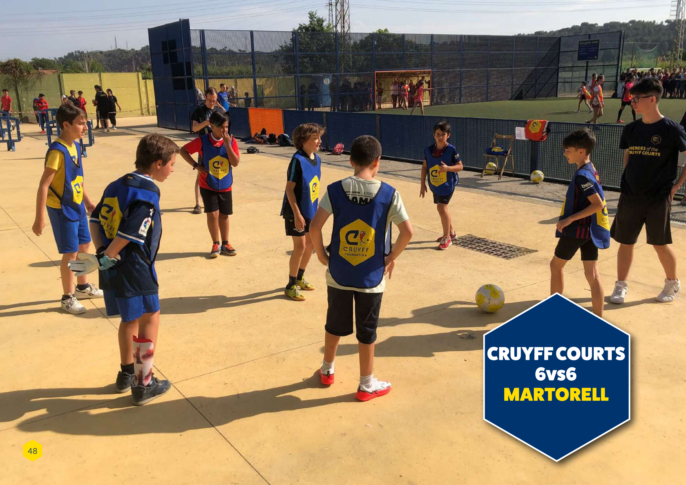
CRUYFF COURTS 6vs6 MARTORELL