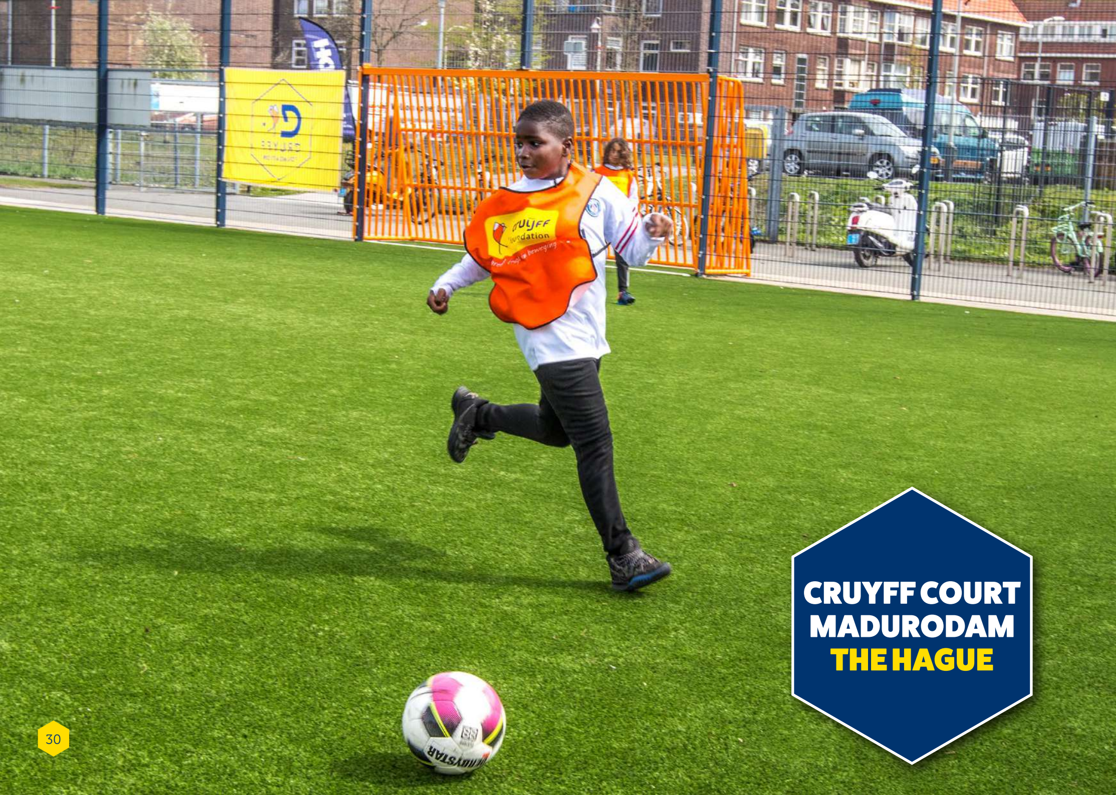
CRUYFF COURT MADURODAM THE HAGUE