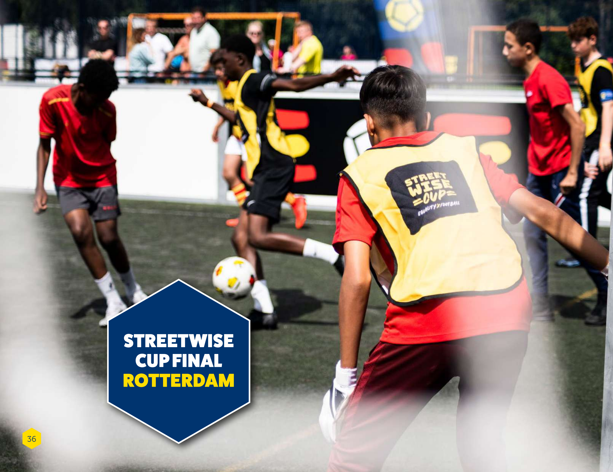
STREETWISE CUP FINAL ROTTERDAM