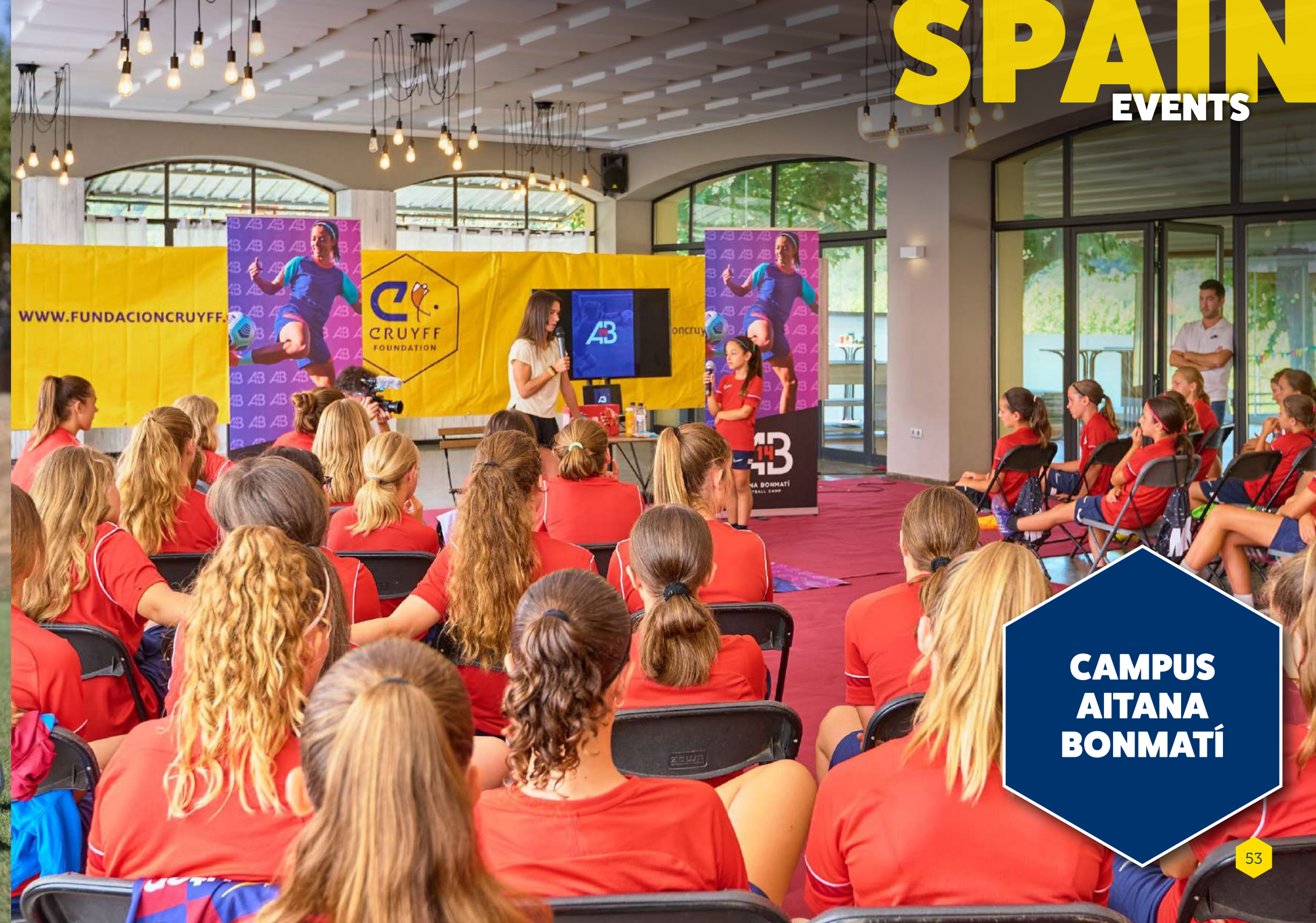
CAMPUS AITANA BONMATÍ