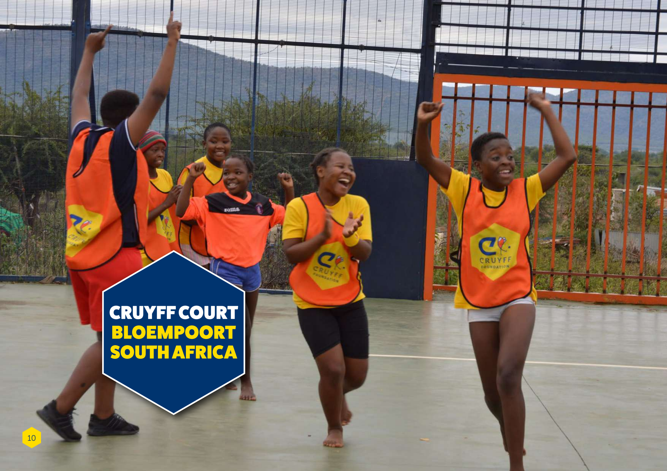
CRUYFF COURT BLOEMPOORT SOUTH AFRICA