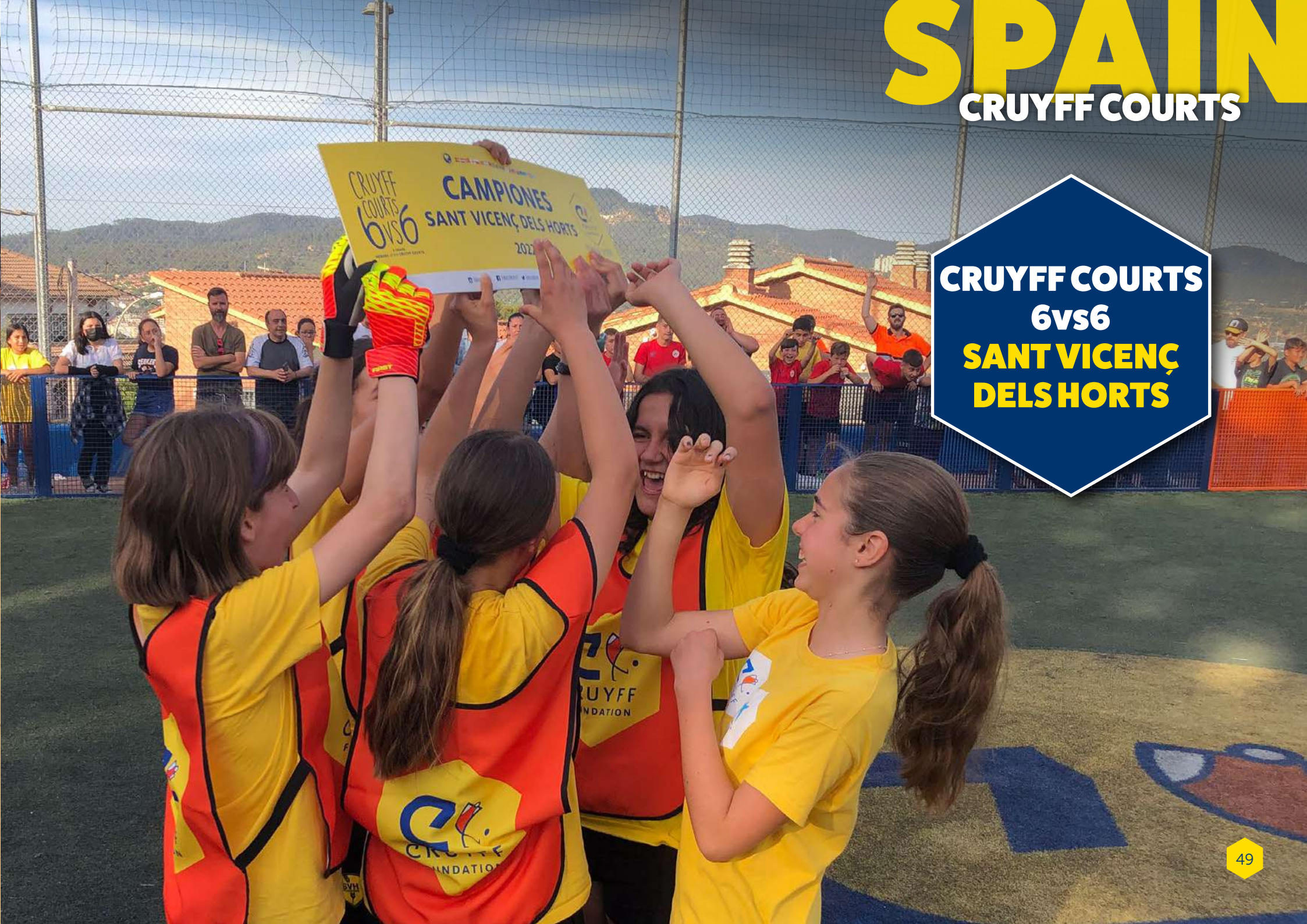
CRUYFF COURTS 6vs6 SANT VICENÇ DELS HORTS