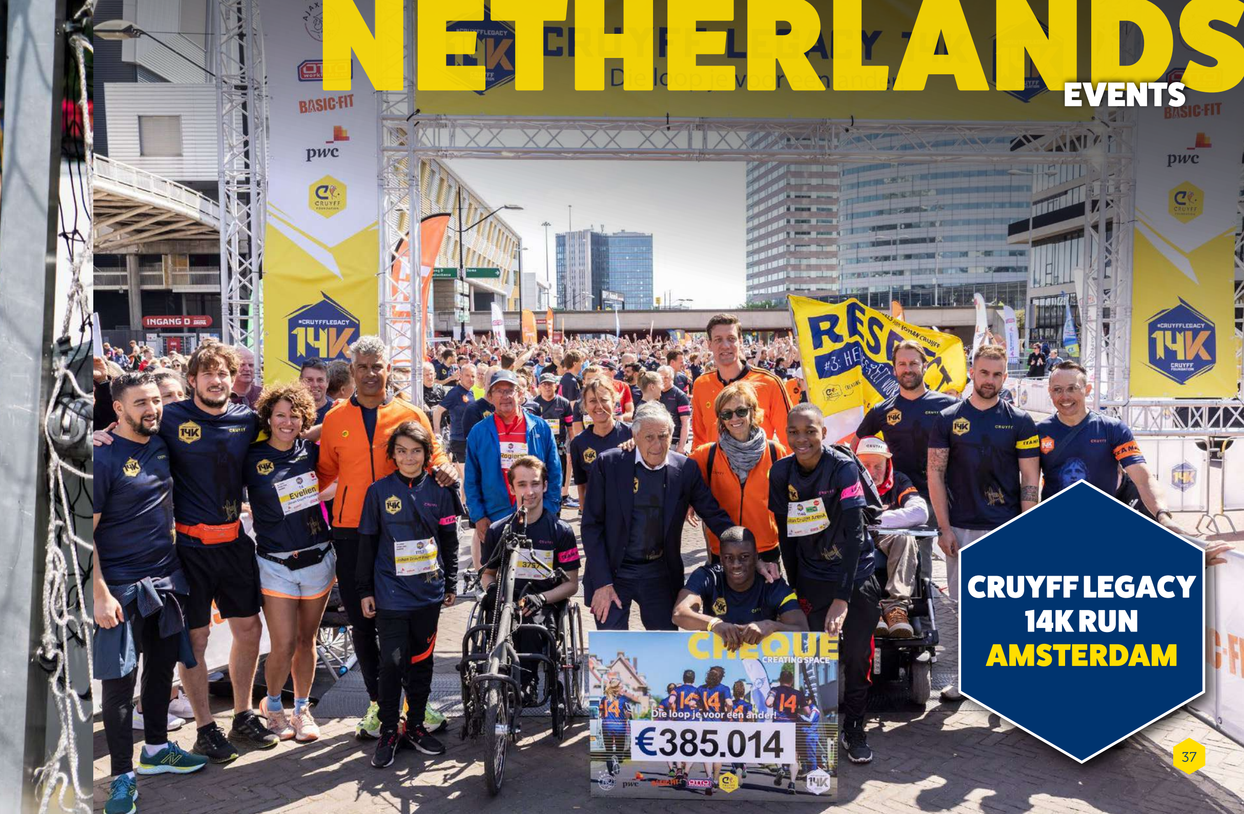
CRUYFF LEGACY 14K RUN AMSTERDAM