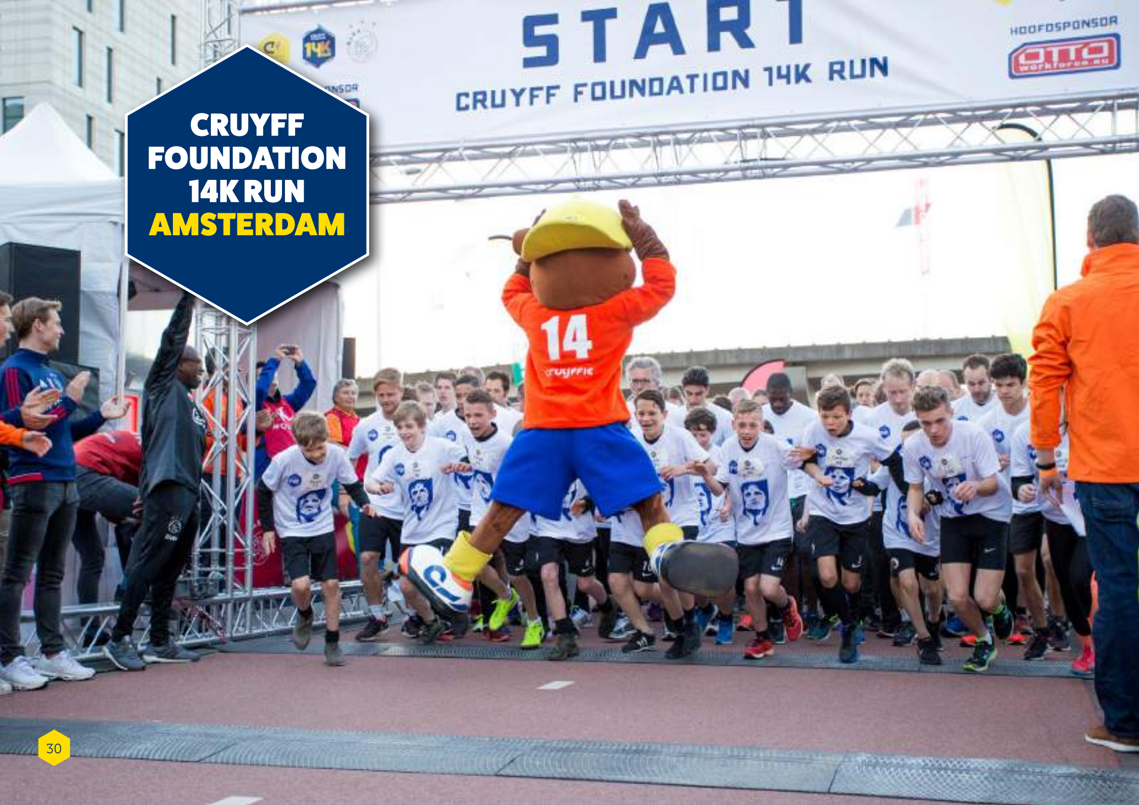
CRUYFF FOUNDATION 14K RUN AMSTERDAM